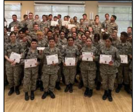
At the end of the event, sixty-five Rocky Mountain Region Members earned the new CAP sUAS Wings.